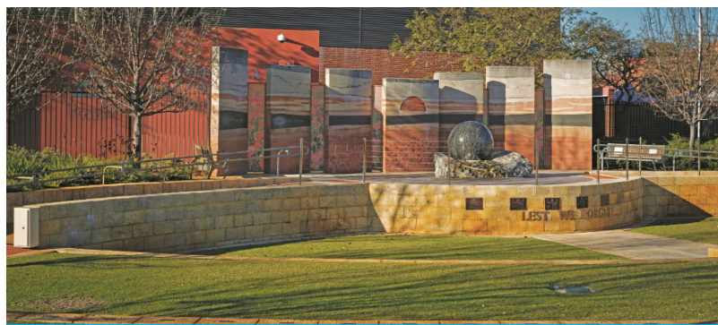
Ballajura Community College War Memorial and Peace Park